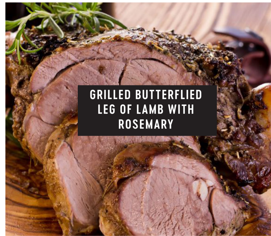
GRILLED BUTTERFLIED LEG OF LAMB WITH ROSEMARY