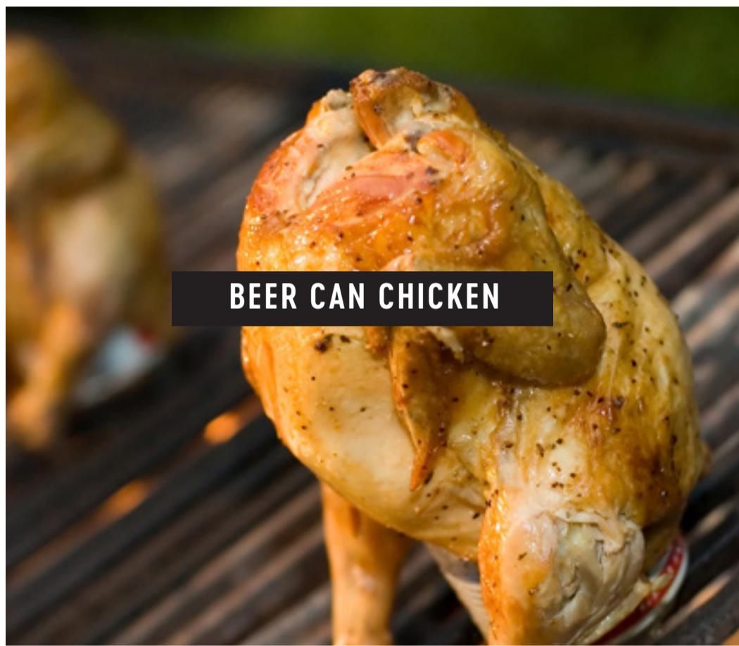
BEER CAN CHICKEN