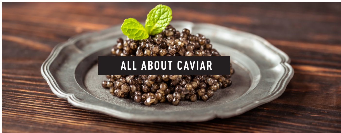
ALL ABOUT CAVIAR

Draeger's Meat, Poultry and Seafood departments display their fresh products cut to order. We feature tender Midwestern beef, award-winning house-made sausages and natural, antibiotic- and hormone-free beef products.